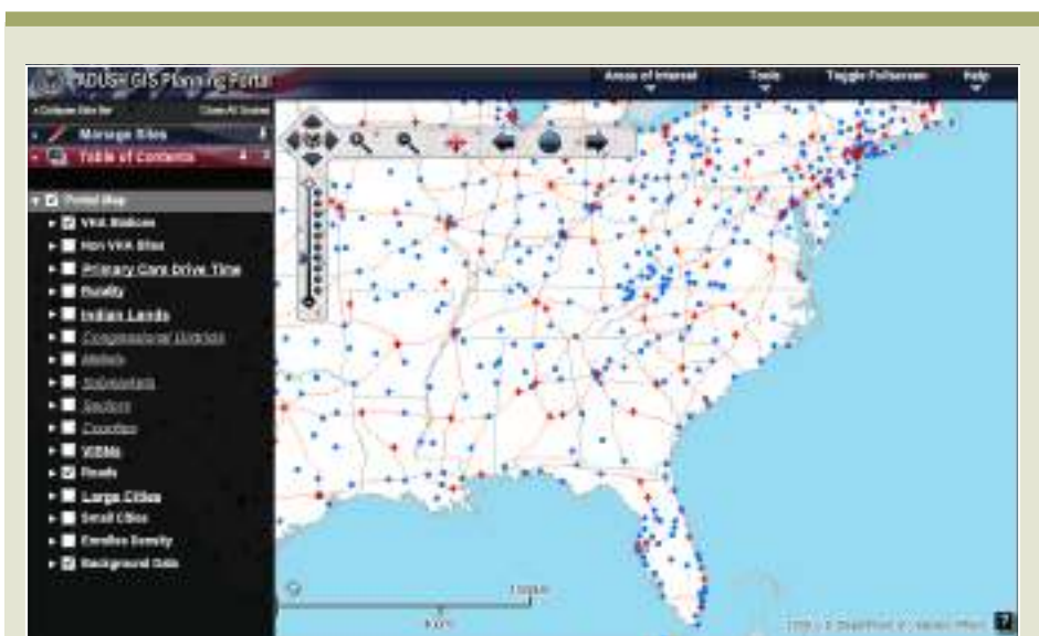
VHA HEALTH CARE ACCESS PLANNING PORTAL SHOWING LOCATIONS OF SITES NATIONWIDE

The Veterans Health Administration operates the largest integrated health care system in the US and one of their specific goals is to deliver high quality health care to the veteran community with the help of timely, relevant and thorough information analysis.